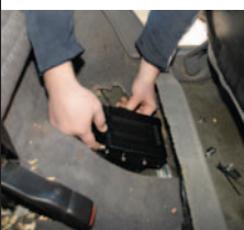
With the mounting holes having been drilled, we placed the radio in the provided cradle mount and secured it in place.