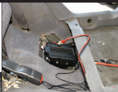
The faceplate separation cable and power supply cables were attached to the radio and routed under the carpet forward to the center console and on to behind the dash.