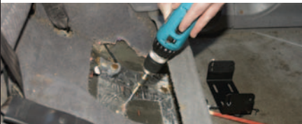
We decided to mount the IC-208H head unit under the rear seat of our '97 Jeep Cherokee, where the factory CD changer would be installed. The carpet already had a cutout, making it easy to remove, and there was a factory heat shield in place to lessen heat transfer from the floorpan.