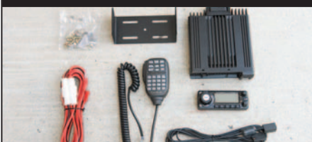
In addition to the transceiver head unit, the IC-208H includes a detachable faceplate and separation cable, a radio mounting bracket and hardware, a remote-control microphone, and a fused power-supply cable.

A S YOU AND YOUR 4x4 TAKE YOUR ADVENTURES INTO MORE REMOTE REGIONS, THE ABILITY TO MAINTAIN CONTACT WITH A BASECAMP OR REACH HELP IN AN EMERGENCY SITUATION SHOULD RANK HIGHLY ON YOUR VEHICLE-PREPARATION CHECKLIST. BEYOND CELL PHONES AND CB RADIOS, WHICH ARE LIMITED IN RANGE FOR THOSE MIDDLE-OF-NOWHERE EXCURSIONS, FM TRANSCEIVERS CAN PROVIDE NEARLY INFALLIBLE LONG-DISTANCE COMMUNICATION FROM ALMOST ANYWHERE.