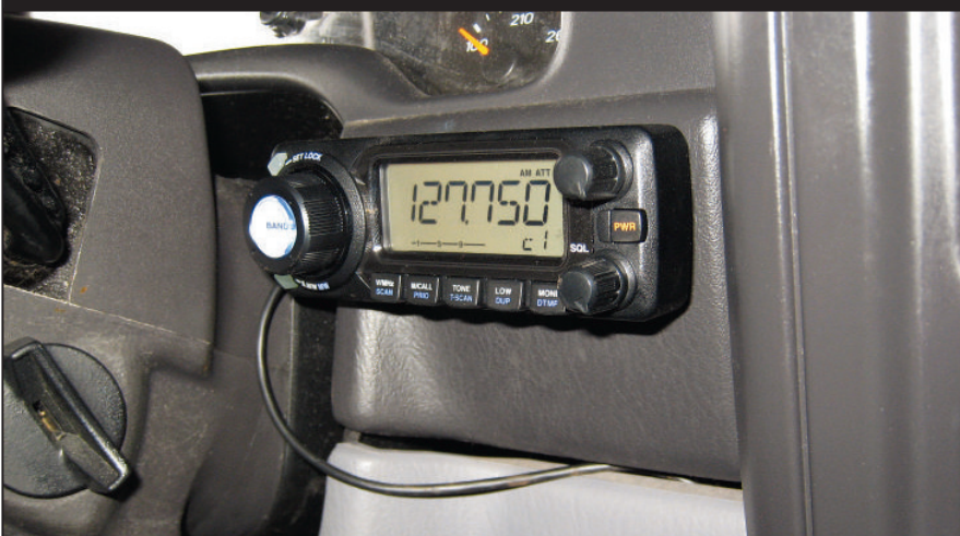
The Icom IC-208H VHF/UHF FM Transceiver will afford continued communication even from the middle of nowhere. The radio's compact detachable faceplate offers multiple mounting possibilities and keeps it within easy reach of the operator.

A S YOU AND YOUR 4x4 TAKE YOUR ADVENTURES INTO MORE REMOTE REGIONS, THE ABILITY TO MAINTAIN CONTACT WITH A BASECAMP OR REACH HELP IN AN EMERGENCY SITUATION SHOULD RANK HIGHLY ON YOUR VEHICLE-PREPARATION CHECKLIST. BEYOND CELL PHONES AND CB RADIOS, WHICH ARE LIMITED IN RANGE FOR THOSE MIDDLE-OF-NOWHERE EXCURSIONS, FM TRANSCEIVERS CAN PROVIDE NEARLY INFALLIBLE LONG-DISTANCE COMMUNICATION FROM ALMOST ANYWHERE.