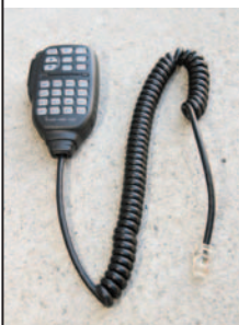
Included with the IC-208H is the HM-133 remote-control microphone, which allows control of most radio functions. It features keypad backlighting and has a coiled Cat 5 network cable for connection to the head unit.